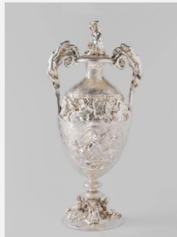
Hippolyte Bayard, 1847 – Frans Pegt, 2013 Antoine Vechte, Silver vase with sea gods, 1843